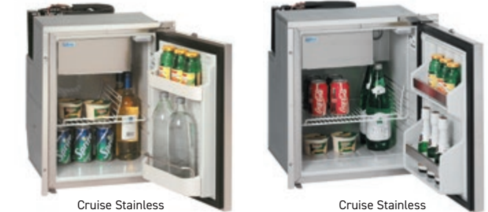
Cruise Stainless Steel 49